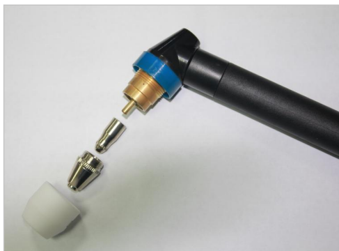
Economical & Long Lasting plasma consumables saves cutting cost