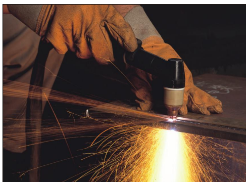
The agility of the machine & precision makes complex profiles easy to cut