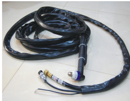
Extremely Reliable & robust torch for Indian shopfloor / site conditions