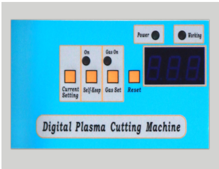
Extremely easy operator panel with easy to select parameters